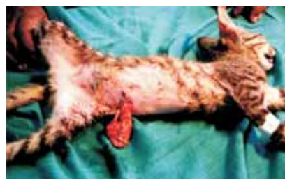
Fig. 1: Abdominal Evisceration

texture (Fig.1). Anti-rabies post bite vaccine was administered.