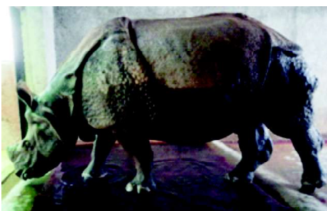
Fig. 3: Foot bath filled with antiseptic solution for wound cleaning