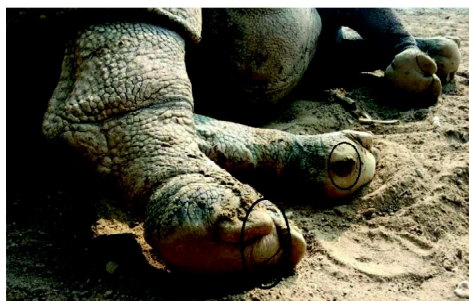
Fig. 1: Circle showing foot pad wounds