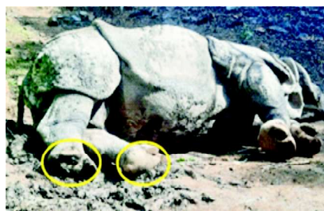
Fig. 4: Circle showing completed healed wound