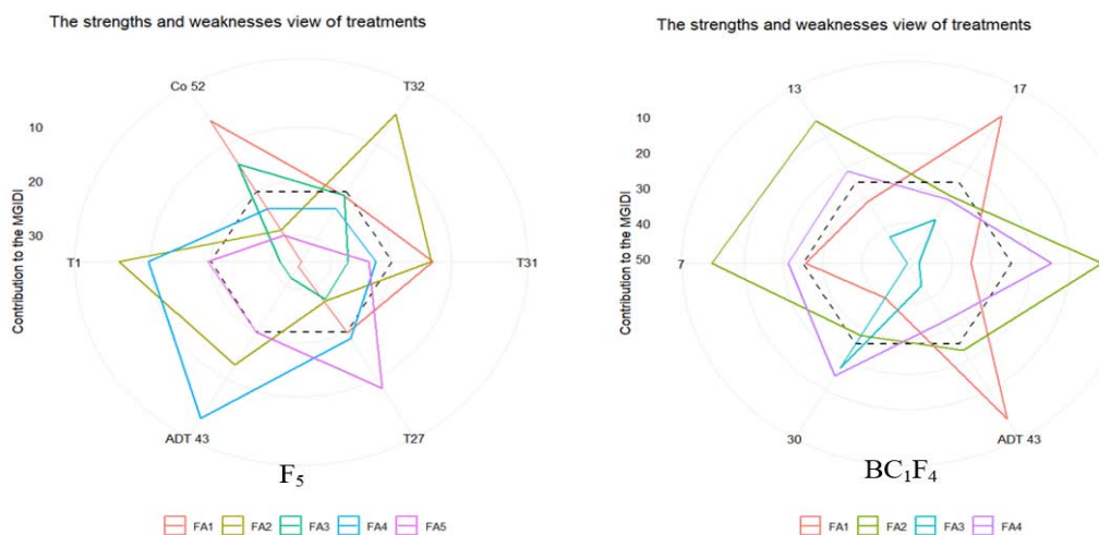
Fig. 3. Visualization of Strengths and Weaknesses of the selected genotypes in stabilized F 5 and BC 1 F 4 families.