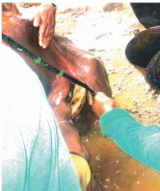
Fig. 2 : Trimming of right overgrown canine tusk with foetotomy wire

0.055 mg/kg of detomidine and 0.15 mg/kg of butorphanol tartrate in young hippos suitable to conduct physical exams, phlebotomy and other routine procedures. The common chemical restraint agent used in hippos were etorphine (1-5 µg/kg) with or without xylazine (67-83 µg/kg) or acepromazine as a component with etorphine mainly for tusk trims (Pearce et al. , 1985, Loomis