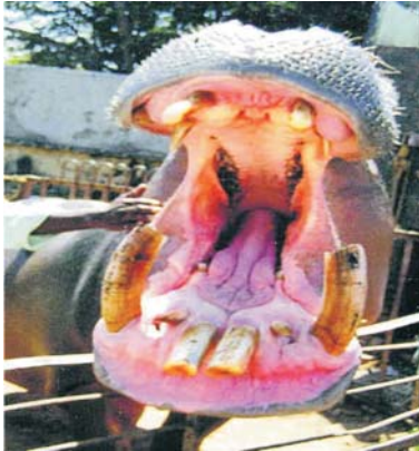
Fig. 1 : Overgrown canine tusks-unable to close the mouth

and Ramsay, 1999 and Morris et al. , 2001). Detomidine at the dose rate of 20 µg/kg provided standing sedation without untoward incidences associated with ventilation-perfusion mismatch leading to hypoxia and hypercapnea (Hornof et al. , 1986).