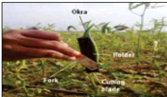
Fig. 2 operation of okra cutter-holder

The tool is held with the help of thumb and other fingers. The stalk of okra pod is then admitted in the throat between blade and pad. The fork ends are then pressed sufficiently so that the blade would come closer to pad (slot), this process cut the pedicel by shearing and separate the pod. At the end of cutting stroke fork ends come closer and the okra pod is caught by the holders. Then cut okra pod could be placed in the basket or bag without touching it. The operation of the tool is illustrated in Fig. 2.